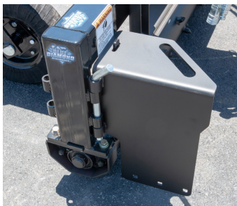
Reversible side shield