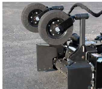
Flip up wheels