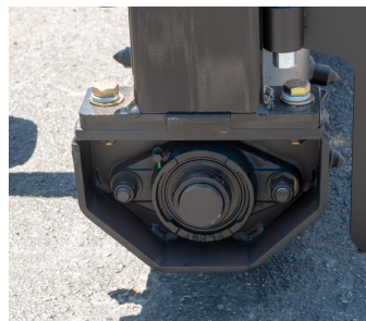
Heavy duty protected bearing