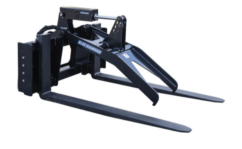
GRAPPLE FORK - SEVERE DUTY