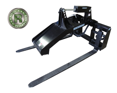
MAT GRAPPLE FORK