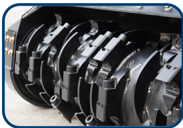
Four Position Anvil Tooth