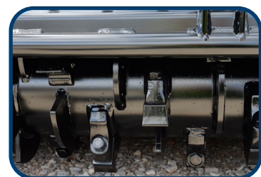
Teeth with bite limiter