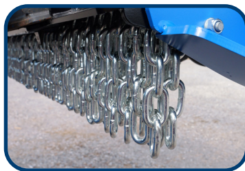
Two chain curtain for protection