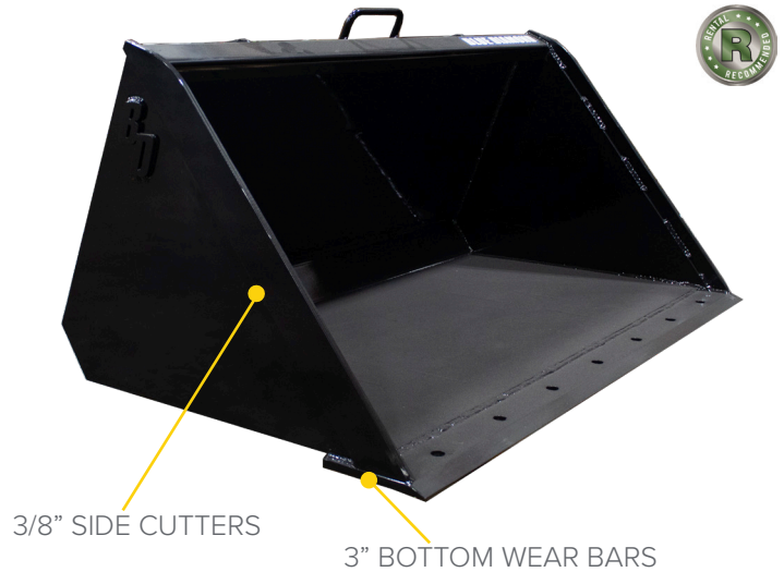
TOP BRACKET FOR TIE-DOWN OR TRANSPORTATION

The Blue Diamond® Mini Skid Steer Heavy Duty Low Profile Bucket is great for grading and leveling applications as well as transporting, loading and other material handling. With a reduced overall height of 20" and curved back, it enables efficient loading and unloading in tight spaces. This bucket is built of high-quality materials with 1/2" thick reinforcement braces and 3" wide bottom wear bars that ensure exceptional strength and longevity. It is available in 36", 44", and 52" widths.