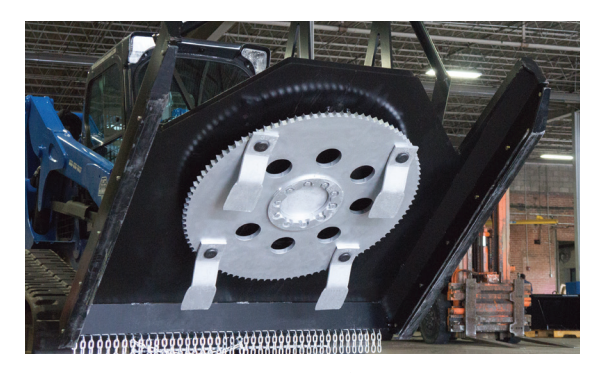
500 LB BLADE CARRIER