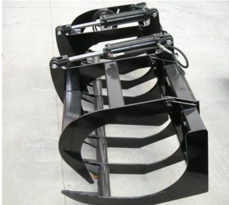
Figure 1 – Root Grapple

The root grapple attachment is vital in the tree industry and is quickly becoming a necessity among all contractors today. This unique root grapple is offered in a variety of sizes for a variety of applications.